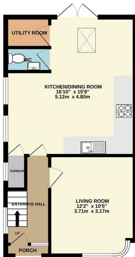
GROUND FLOOR 454 sq.ft. (42.2 sq.m.) approx.